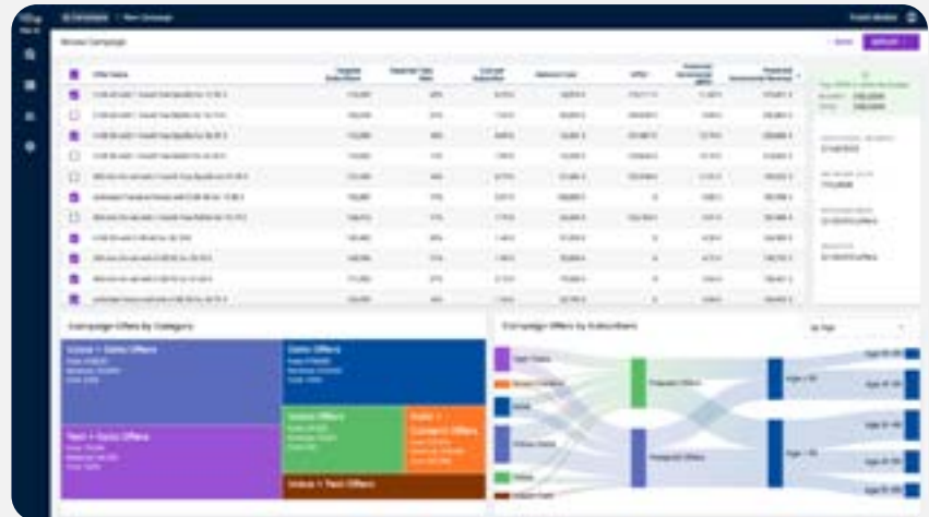
Figure 1: PlanAI (intelligent monetization)

Totogi Wholesale BSS Platform manages the full lead-to-cash cycle of customers and is perfectly designed functionally and architecturally for MVNOs. Including a full BSS running natively on AWS cloud, and with an AI-first approach offering a whole range of intelligent monetization services.